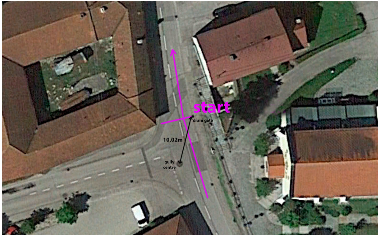
start of the 6h race