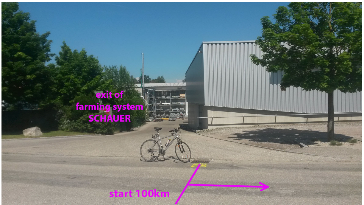
start of the 100km race and 12h race